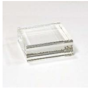
2 X 2 Block