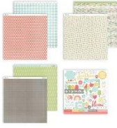
Zoe Paper Pack