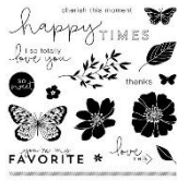
So Sweet Stamp of the Month