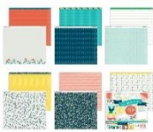
So Much Happy