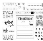
This Happened SOTM